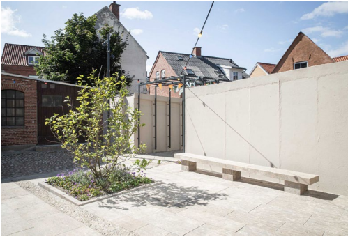
The Passage and The Smithy, LILA 2024 Jury Award

Client: Statens Vegvesen Role: Lead landscape architect