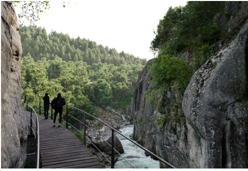
Ryfylke National Tourist Route